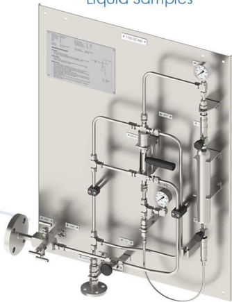
Cylinder Type with Cooler for Hot Samples